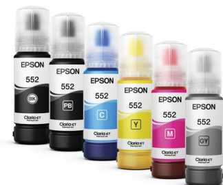
Replacement ink bottles

Product protection you can count on — 2-year limited warranty with registration